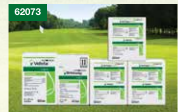
62073 Fairy Ring Solution