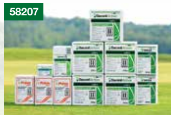
58207 All Season Solution