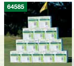
64585 Contact Action Solution