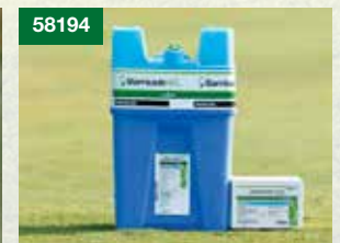
58194 Warm Season Herbicide Solution