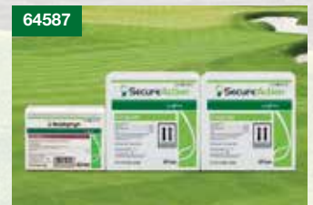
64587 Fairway Action Protector Solution