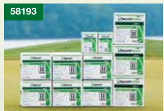
58193 Greens Contact Solution